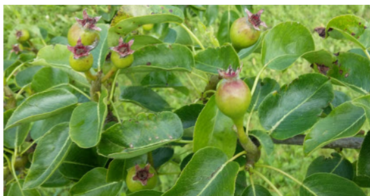
Doyenne de Comice Pears

The currants are laden with fruit and good growth so we are building support systems to keep them off the ground and the gooseberries have a reasonable set too. The summer and autumn raspberries are growing despite the competition from the grass and weeds and hopefully they will be strong enough to give us good crops yet again. Also the logan and tay berries are looking good with lots of flowers.