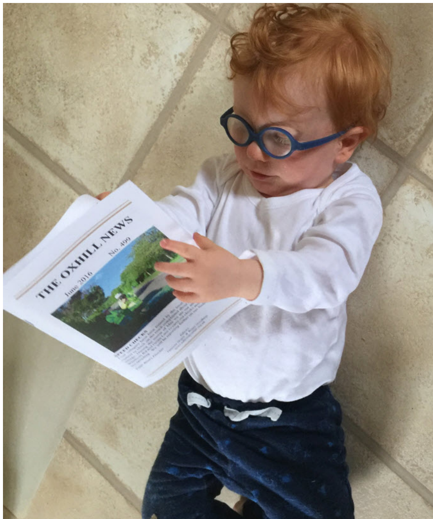
Our youngest reader