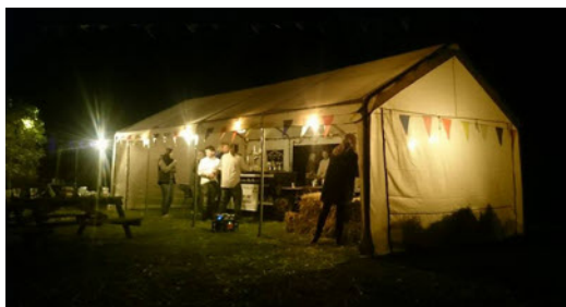
The Peacock Tent at Sugafest